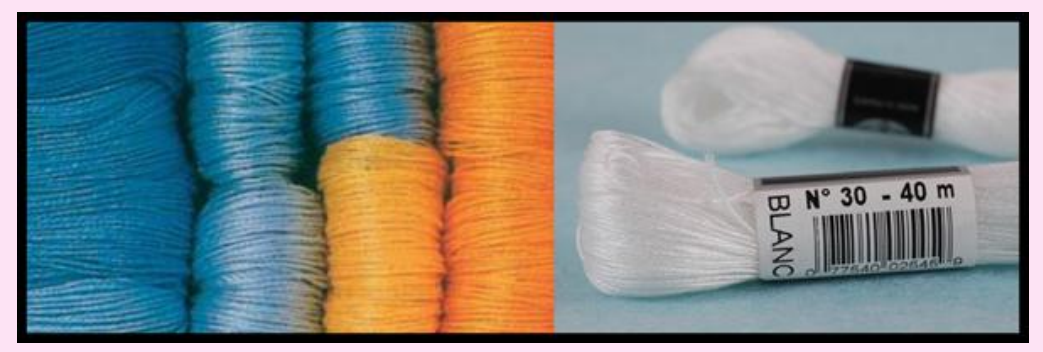
coton á broder

DMC also make a similar range of thicknesses and colours and both Anchor and DMC are widely available.