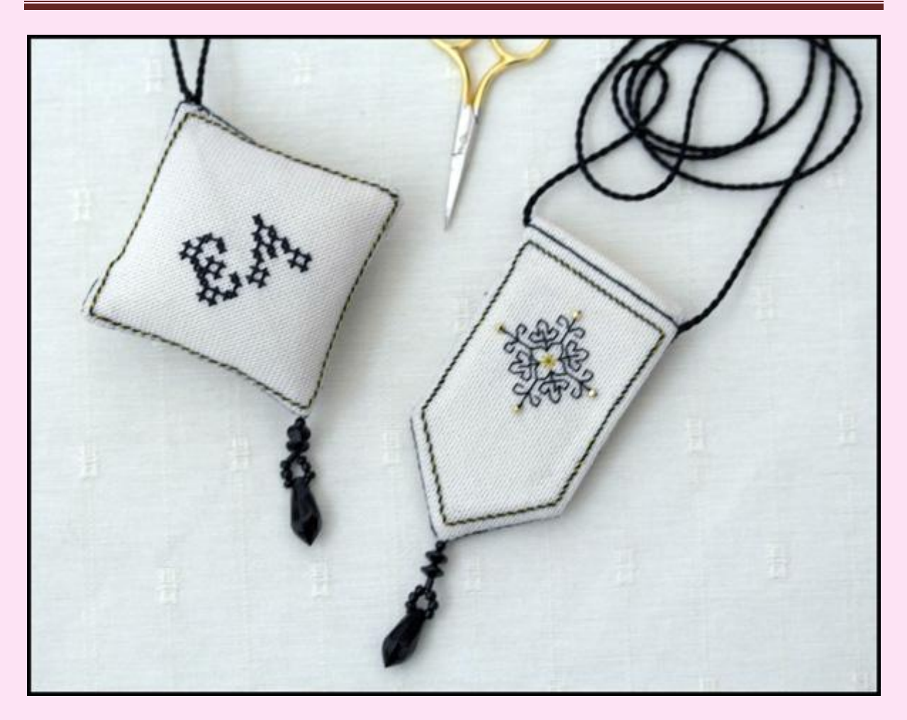
CH0304 Petite Treasures - Front and Back A modern scissor keeper and pin keeper!

I hope you enjoy this month's Blog. If you have any questions please contact: