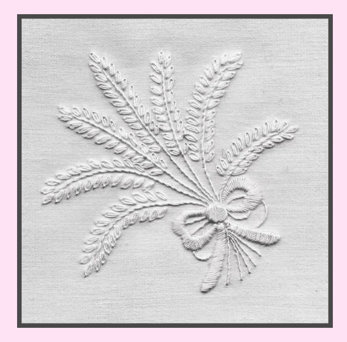
Lavender embroidered in coton á broder on medium weight cotton

Designs do not have to be complicated to be effective. This embroidery uses four basic stitches and one colour to create an interesting design which can be used in a variety of ways. A plain linen blouse would benefit from a lavender spray, a wedding cushion can be personalised, a horseshoe with an embroidered spray for a Scottish guest, to name but a few.